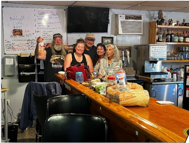
GI PARTY CREW