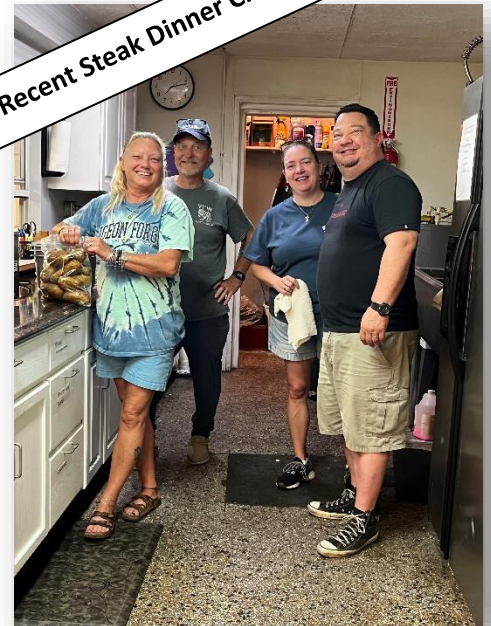
Recent Steak Dinner Crew

THANK YOU! THANK YOU! THANK YOU! THANK YOU! THANK YOU! THANK YOU! THANK YOU! THANK YOU!