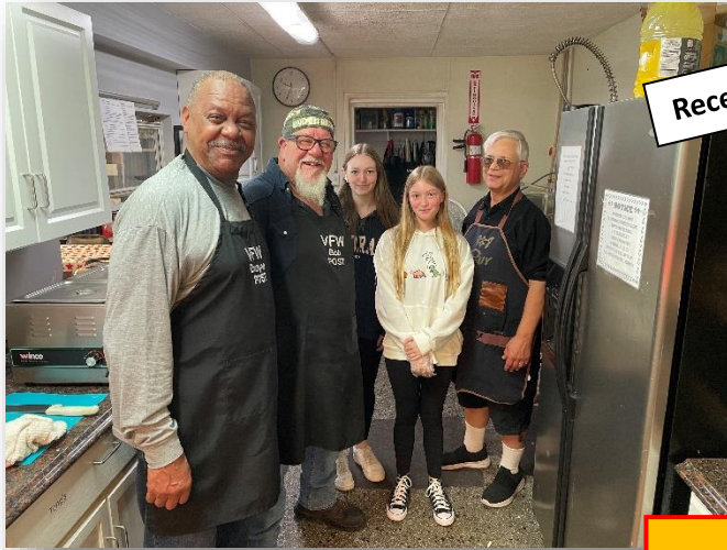
Recent breakfast crew.