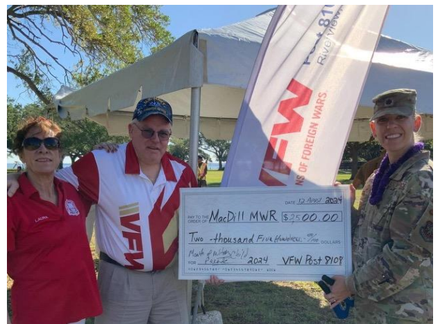
Post members present a check for $2,500 to the MacDill AFB – Morale, Welfare & Recreation Program.

If it's been a while since a Buddy, or someone you know, has checked in... then it just might be time for you to check in with them and see if they're alright. They just might happen to be waiting for that call. You can make a difference.