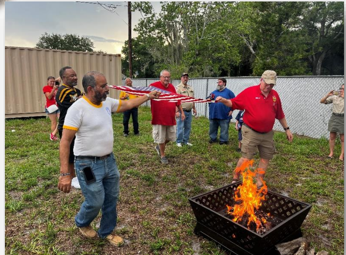
Scouts from Troop 83 and Pack 205 visited the Post and participated in a flag retirement ceremony on Flag Day – June 14, 2024. Post members and guests also took part in the event.